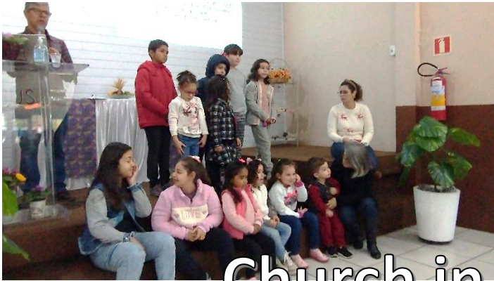
Church in Agronomia