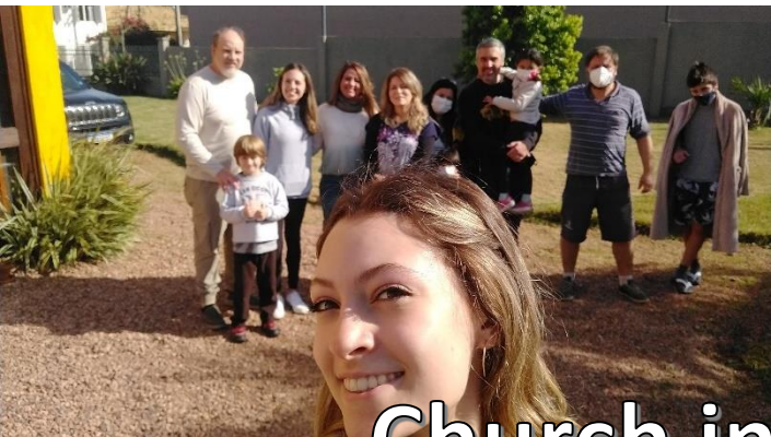
Church in Zona Sul