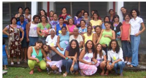
2nd Annual Ladies Retreat in Sergipe

Charm is deceptive, and beauty is fleeting; but a woman who fears the LORD is to be praised. Prov. 31:30