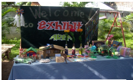
Math & Science Fair

Parents and children got the opportunity to showcase their creative talents during the Math & Science Fair celebration for the month of September. With the help and assistance from their parents, the pupils were asked to submit a project from indigenous and recycled materials. The teachers were so amazed at how such art project turn out a success. Parents and their children came up with beautiful creations from almost everything we could ever think of such as wall and hanging decorations, flower vase, handbags, etc. The teachers incorporated a quiz bee for the children during the program and our teammate Johnny Eastep was the guest speaker for the event.