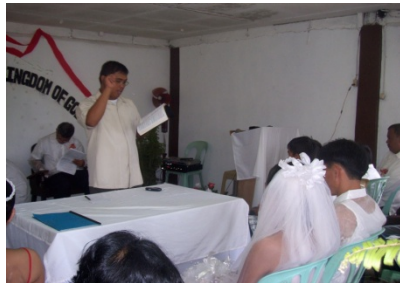
Wedding at Mahalit

hardworking fellow and it was a great joy for me to give an encouraging message from the scriptures on his wedding day. I was supposed to be one of the officiating ministers on his wedding but having been out of the country for almost three years, I was not able to renew my license to solemnize marriages. Just a couple of months ago, I was also requested to officiate a wedding in the small town of Mahalit. I did the ceremony and message and another preacher signed the marriage contract.