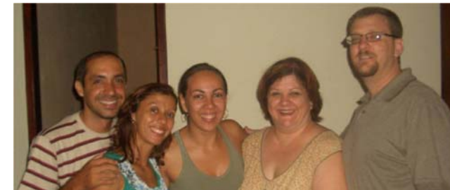
We have a prayer page on the Southgate Church of Christ website that has everyone's pictures and a little bit about them.