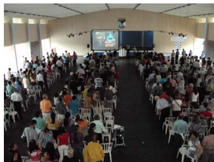
Area Wide worship in Recife, Brazil

Now may the God who gives perseverance and encouragement grant you to be of the same mind with one another according to Christ Jesus; that with one accord you may with one voice glorify the God and Father of our Lord Jesus Christ. Rom. 15:5-6