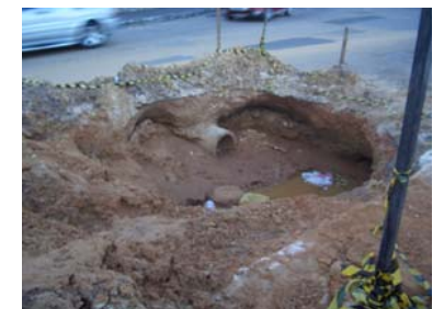
The now rather large hole is staked off and it remained exactly as you see it here for 3 more weeks. It was eventually fixed. They say you can lose a car in a pothole here.