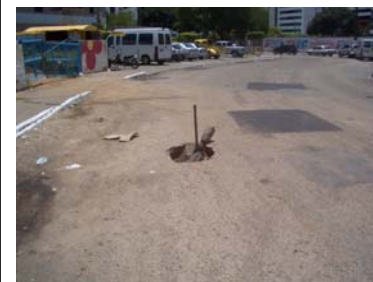
Someone was driving along and a piece of the road just caved in. Rob helped some men lift the car out of the hole. A stick was put in it so other cars could avoid the hole. It stayed like this for 1 week.