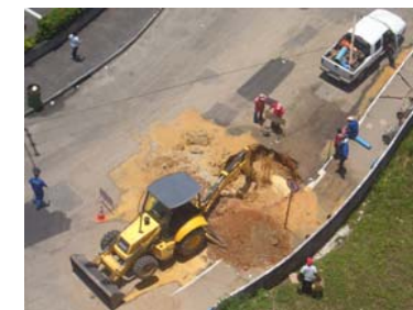
Then the backhoe came and hit a water line. Note the spray of water and the extra workers watching as they are seated on the sidelines.