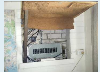
Old breaker board that will be replaced this next week!

So stay tuned for updates ... or better yet ... bless us and future generations of students by getting involved!