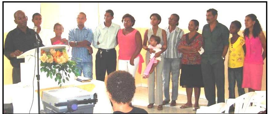
Birth of New Congregation! In Marcos Freire – Municipality of Socorro