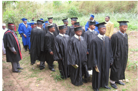
2008 - Thirteen Graduates of NIATS

One of the graduating students, selected to speak at their graduation service while I was there, said, "I will neither forget nor fail to mention the love and championship that existed among the students, we lived together as one big family...the time devoted to prayers and fasting were especially of much benefit to us...however it was not all a bed of roses, as we passed through very difficult times such as when there was not enough food...stressful task of going almost outside the premises to fetch water...not enough beds for students to lie on, as some are lying on the floor....in conclusion, we call on those who desire to work for Christ to enroll into the institution..." In the face of their own difficulties as students, they were excited about taking their place alongside a number of several great evangelists in the country to help build a strong church and to preach God's message to their people.