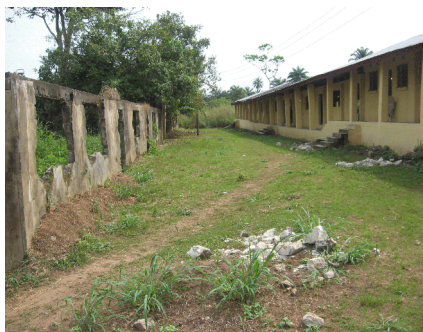
Left, burned out section of the School During Tribal Conflict. Right, New School Rebuilt After Conflict.