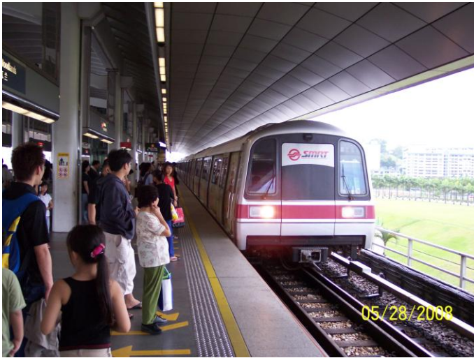
Efficient public transportation... the MRT “Mass Rapid Transportation” (both above & underground)