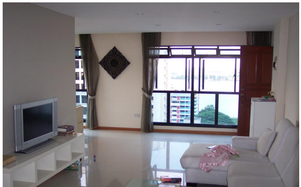
Living room view of our apartment... perfect size for small group Bible studies!

Tom Goracke Cell Phone: (308) 641-3592 P.O. Box 451 Beatrice, NE 68310 Email: twoservants2002@yahoo.com