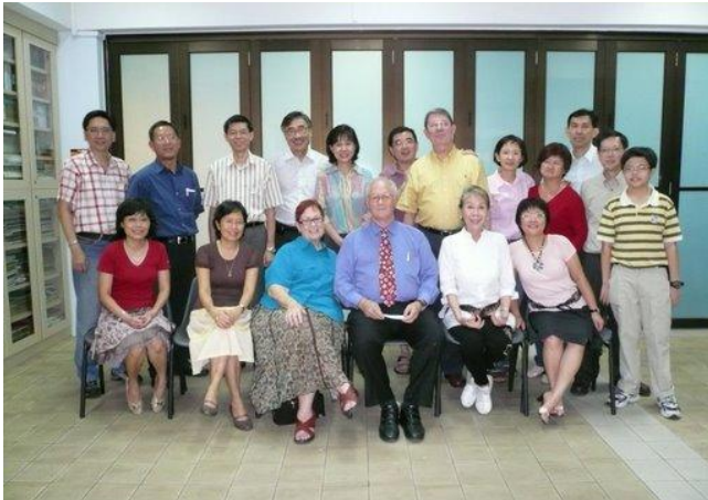
General Epistles class - A study of the letters of James, and 1 st & 2 nd Peter

In other preparations for settling in, I have finished all of the required forms for me and my family to acquire legal residence. Now, it is a matter of waiting for those official documents to come through.... probably less than two weeks... we hope! Now that we are moved into our apartment, we will be addressing additional needs of window security (to keep the kids from crawling out... that first step is a doozy!) and several utility needs. We secured our temporary cell phone service for needed communication over here, but we are still researching what our needs will be for international phone communication. Until we iron out those details, email will probably be the best form of communication to reach us by and that might be limited at times until we work out our new utility services. That's enough of the settling in activities for now. They will be ongoing for some time yet.