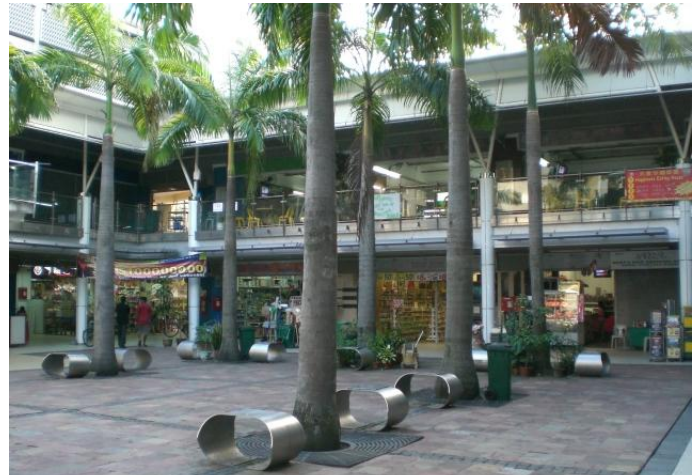
Apartment ground floor courtyard and shopping areas