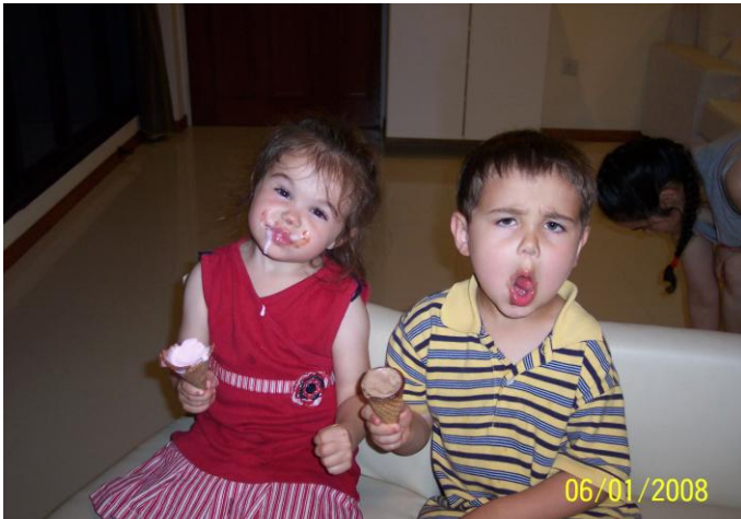
A little ice cream treat to beat the humidity and heat